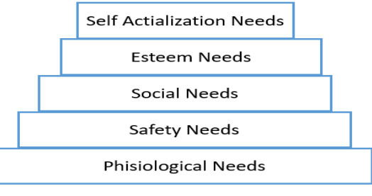
Figure 3. Maslow's Hierarchy of Needs

According to observations and interviews the planning process was carried out in very different ways from formal schools. In Bahari Children School in planning it is sufficient to make an overview of the material to be delivered using the required media. Planning is adjusted to the applicable curriculum so that it does not leave the context of learning. The curriculum that applies at the Bahari Children's School is in accordance with its name regarding marine life or marine life so that coastal children know about their environment and this is balanced with general learning in formal schools. In planning learning, it can increase learning motivation by using interesting learning descriptions, by designing or compiling pearl sentences that will be given to coastal children so that they can provide stimulation and encouragement to children to be more enthusiastic in learning and continuing education. Furthermore, in learning motivation or encouragement is needed, Maslow's theory which is known as the "hierarchy of needs" will identify the needs that need to be possessed by students (Minderop, 2011).