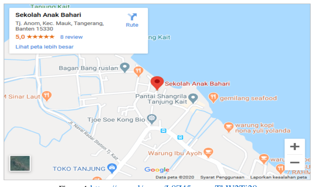
Figure 1 https://goo.gl/maps/L8Z45nmcmTbW2Ti28

This type of research focuses on community activities that aim to increase learning motivation for coastal children, this research was conducted in Tanjung Kait Village, RT 001, RW 001, Tanjung Anom Village, Mauk District, and Tangerang Regency.